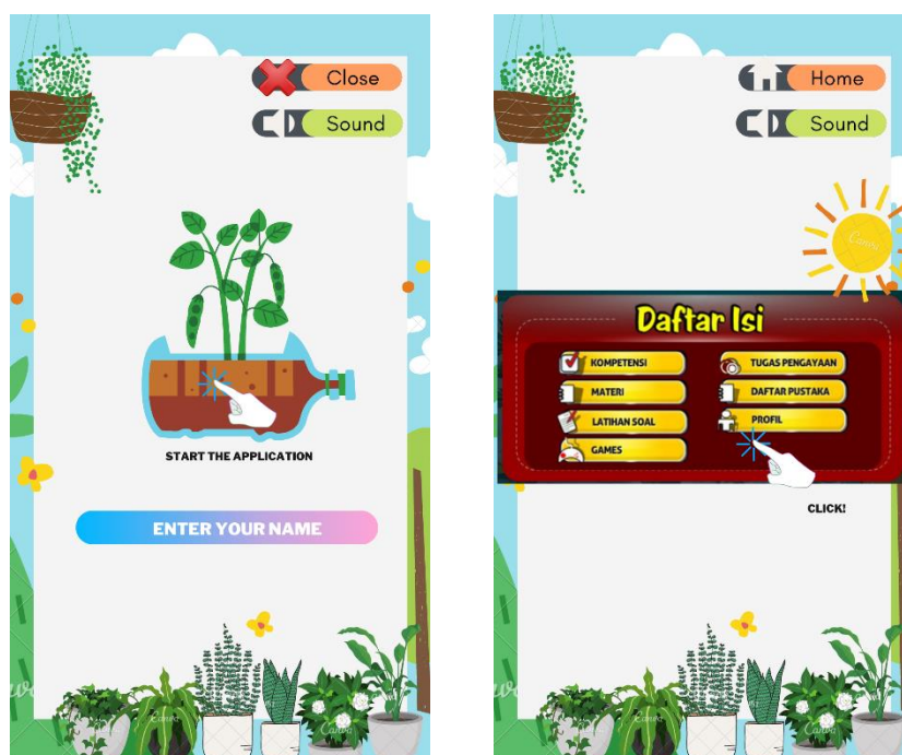
Figure 1. Display of Biotanical Flash Application

In interactive activities, students can interact actively and improve their experience with a botanical application, this is because of the combination of audio, video, graphics, images, and animation elements. This process can be attractive and can generate feelings of pleasure, attention, interest, and student involvement (Tan et al., 2010). And in reflective activities, students reflect on all their learning experiences so that they adjust their conceptions, which will then be transformed into assignments into tests.