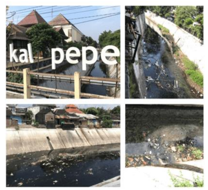
Figure 1. The Condition of Pepe River Polluted by Household Waste

Edubiotik: Jurnal Pendidikan, Biologi dan Terapan Vol. 6, No. 02 (2021), pp. 160 – 171