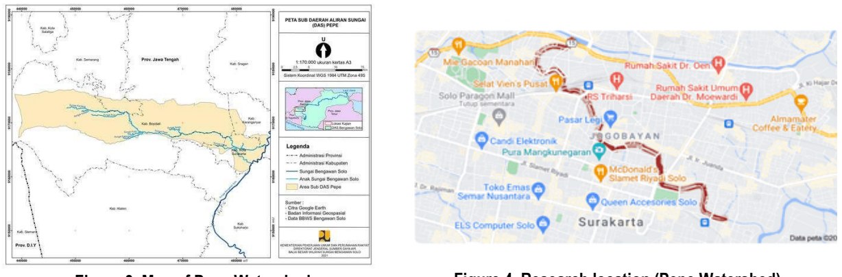
Figure 3. Map of Pepe Watershed

et al., 2010). Map of pepe watershed can be seen in Figure 3 and research location (pepe watershed) can be seen in Figure 4.