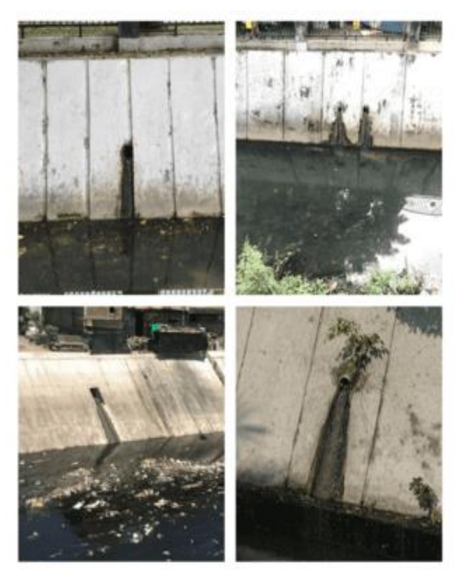
Figure 2. Household Water Lines from the Residential Area