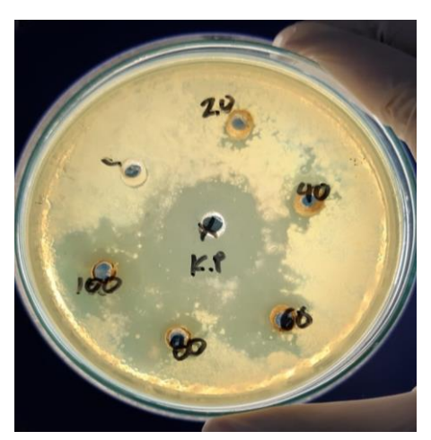
Figure 1. Antibacterial Activity of Kecombrang Leaves Against Klebsiella pneumoniae

Edubiotik: Jurnal Pendidikan, Biologi dan Terapan Vol. 7, No. 01 (2022), pp. 36 – 42