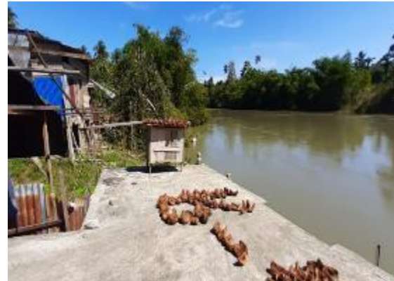
Figure 1. Station 1 Located in A Residential Area