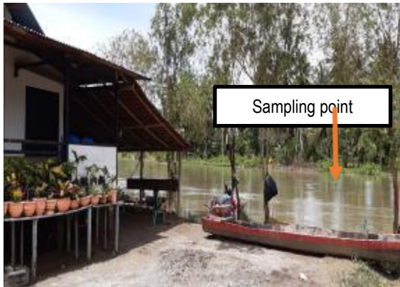
Figure 2. Station 2 Located in The Central Market

The type of this research was quantitative descriptive research which shows a description from the data obtained at the observation location. This research was conducted in the Poso river in the Poso Kota Selatan and Poso Kota sub-districts in July - August 2021. The data/sample collection sites consisted of 4 stations including: station 1 located in a residential area (Figure 1); station 2 located in the central market (Figure 2); station 3 located in the tofu industry (Figure 3); and station 4 located in the estuary area (Figure 4).