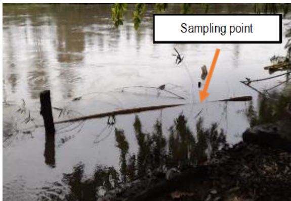
Figure 3. Station 3 Located in The Tofu Industry