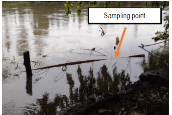
Figure 3. Station 3 Located in The Tofu Industry Figure 4. Station 4 Located in The Estuary Area