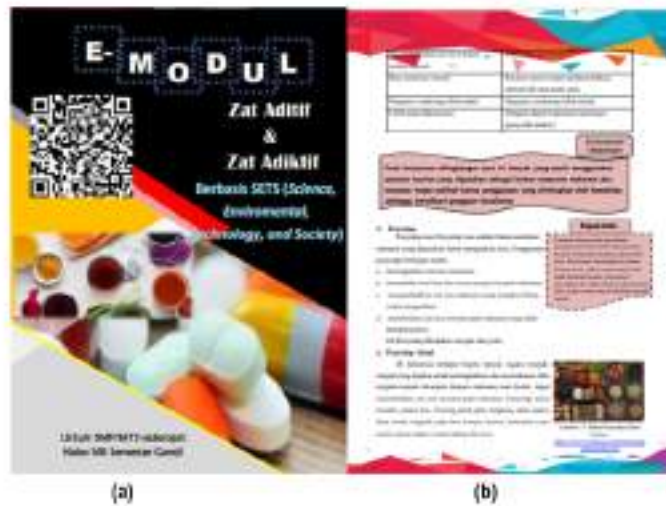
Figure 1. (a) Front cover of e-module and (b) material content of e-module

Development Stage, including expert validation test, revision, and N-gain analysis. The result of validity of SETS-based science e-module on additive and addictive substances material were obtained through a validation sheet that had been filled out by 3 science teacher validators at SMP Negeri 1 Jember. The results of validity analysis of the e-module can be seen in Table 4.