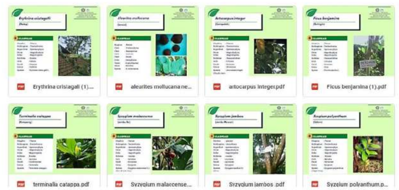
Figure 4. Database of P-Wec plants that can be scanned using Pic media based on qr-code

This PIC media based on QR-Code is very helpful because it uses plants around the P-WEC Conservation as a source of information so that students can observe and prove the information presented in the application with real plants. It also helpful because the visualization can help students to understand simple to complex concepts. The development of information and communication technology is able to support the teaching and learning process of biology by utilizing simulation and visualization to build visuals, representations and problem solving for students (Patil, 2020), so learning about identifying plants can be easier to conducted.