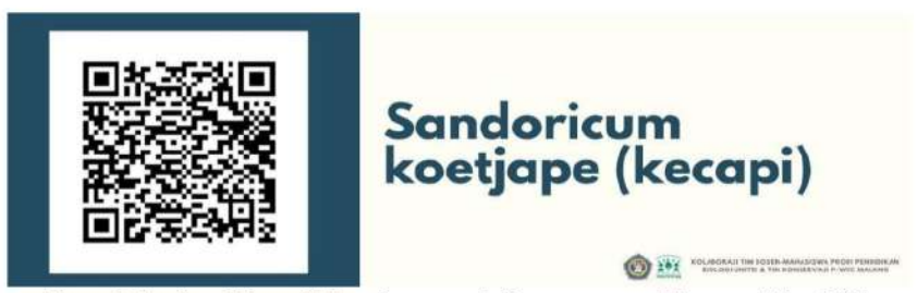
Figure 3. Display of Pic media based on gr-code

The use of QR-Code is also able to increase efficiency in the learning environment because it prevents students from wasting time on search engines and being exposed to irrelevant information, besides that, easy access is also offered because the QR-Code can be accessed by students' mobile devices through a scanner application so that allows students to access more information more easily and has the potential to increase student learning potential (Musthofa, 2016; Ucak, 2019). The use of QR Codes is also able to facilitate student learning, where in their research the majority of students think that the use of QR Codes in learning medicinal plants is easy to employ, this is because most of the respondents stated that they are interested in this learning system so that it can have a positive impact on students. In addition, the integration of the learning experience with smartphones in accessing the QR-Code provides flexibility and valid information to students due to a direct process in accessing information that downloads valid information to students due to a direct process in accessing information that downloads valid information and the material being studied in detail (Zakaria et al., 2019; Kharir, 2020). The display of PIC Media based on QR-Code can be shown in Figure 3 and the database of P-Wec plants can be shown in Figure 4 below: