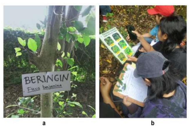
Figure 1. (a) Handwritten plant information board; (b) Students learning through plant drawing sheets

One of the suitable learning areas for studying Biology is the P-WEC (Petungsewu Wildlife Education Center) conservation area, located in the JI. Wildlife 1, Petungsewu Village, Kec. Dau, Malang Regency. P-WEC is an informal education centred on nature and wildlife conservation which was established in 2003 with the educational method used is experiential learning through an adventure and game approach. In practice, nature is used as a learning medium, most of the learning time is spent in nature, so this area is suitable for carrying out the Biology learning process for students (P-WEC, 2021). However, based on observations and interviews conducted by P-WEC, there are several obstacles in studying wild plants, some of them are: (1) the plant information board only listed the names of existing plants; (2) there are still some plants that do not have information boards so that information is not available in them; (3) some of the information boards presented are easily damaged, especially during the rainy season; (4) some students sometimes have difficulty studying the variety of plants when exploring because there is not much information presented. Documentation of observations as shown in Figure 1.