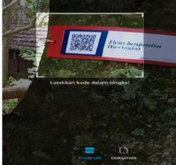
Figure 2. The use of Pic media based on qr-code using scanner app