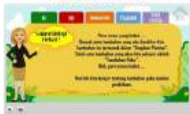
Figure 5. Introductory Slide View on Mobile Learning-Based Practicum Instructions