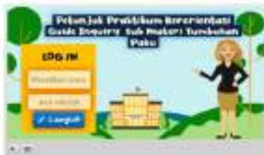
Figure 3. Title Display of Mobile Learning-Based Practicum Instructions

The design stage aims to produce mobile learning-based practicum instructions with a Guide Inquiry approach to improving critical thinking skills. The steps to design mobile learning-based practicum instructions with the Guide Inquiry approach are to analyze the curriculum, determine essential competencies and subjects, determine the title of practicum instructions, compile fern plant materials, compile fern plant catalogs, compile the structure of mobile learning-based practicum instructions, compile a mobile learning-based practicum instruction design in the articulate storyline application. The display of mobile learning-based practicum instructions can be seen in Figure 3. The main menu display on mobile learning-based practicum instructions be seen in Figure 4. The introductory slide view on mobile learning-based practicum instructions presented as in Figure 5. The slide view of learning steps guide inquiry on mobile learning-based practicum instructions can be seen in Figure 6. The fern plant catalog slide view on mobile learning-based practicum instructions presented as in Figure 7. The information slide view in mobile learning-based practicum instructions reflected in Figure 8.