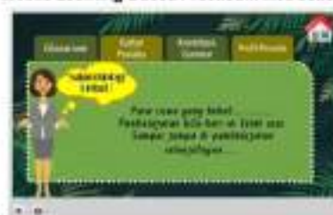
Figure 8. Information Slide View in Mobile Learning-Based Practicum Instructions