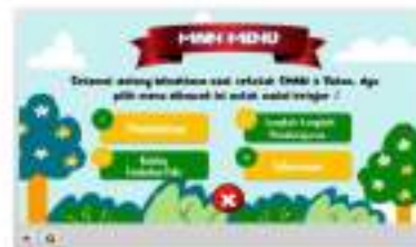
Figure 4. Main Menu Display on Mobile Learning-Based Practicum Instructions