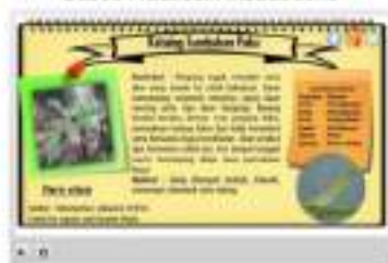
Figure 7. Fern Plant Catalog Slide View on Mobile Learning-Based Practicum Instructions