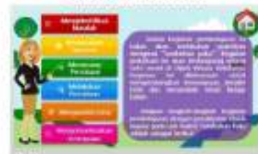
Figure 6. Slide View of Learning Steps Guide Inquiry on Mobile Learning-Based Practicum Instructions