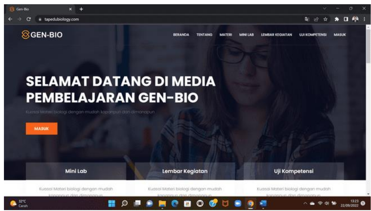
Figure 2. Display of Web App-Based General Biology Content on the GEN-BIO Platform