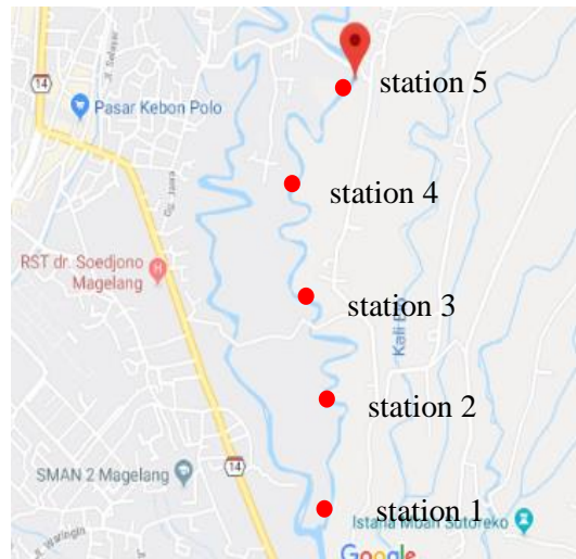
Figure 1. The Research Location in the Bolong river Watershed, Ngasem Village, Wates District, Magelang City. The Red Circle Indicates The Sampling Location for Macrozoobenthos

The Macrozoobenthic sample was taken at 5 different research stations. At each station, three spots were chosen to represent the right bank, the left bank, and the middle of the river. The data analyzed was not only the number of Macrozoobenthos but also the physical parameters. The physical parameters are temperature, depth, turbidity, the color of water, and water odor that were also identified as supporting data, as well as uniformity and diversity indexes to determine the quality of river water. The data analysis in this research uses the Shannon-Wiener Diversity Index ( \hat{H} ) and the level of water pollution is determined based on the Krebs classification (Akindele et al., 2019; Fastawa et al., 2019).