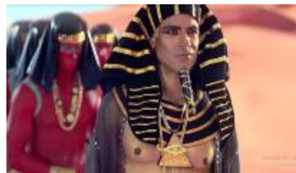
Figure 8. Fifth Suitor King