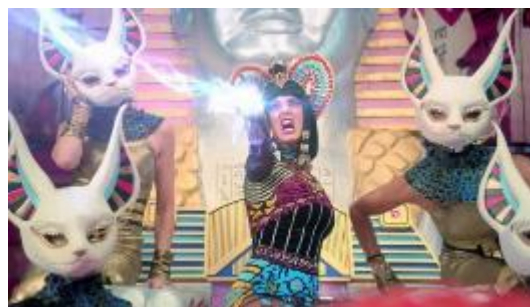
Figure 10. Magic