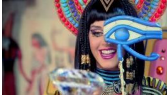
Figure 9. The Eye of Horus Symbol