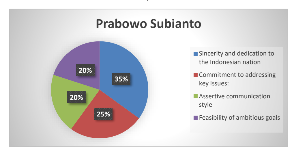
Table 2. Key Element Prabowo Subianto

Prabowo Subianto's communication style conveyed sincerity and dedication to the betterment of Indonesia, garnering support from those who prioritized strong leadership. His commitment to tackling issues such as poverty and corruption, albeit with ambitious goals, demonstrated a proactive approach to governance.